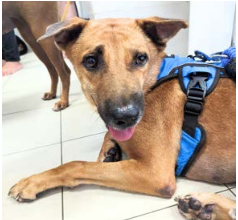
Nugget was rescued with a short tail infested by maggots. It seemed amputated, but, in reality, it had been shortened due to his injury before the rescue.

On a daily basis there are as many as two to three volunteers who support with treatment. Communication is key and volunteers share videos of everything from treatment methods to observations. Through patience and care, volunteers hope to improve the future of each rescue by supporting each rescue's health and socialisation journey so they can have a strong chance at finding their forever home. 🐾