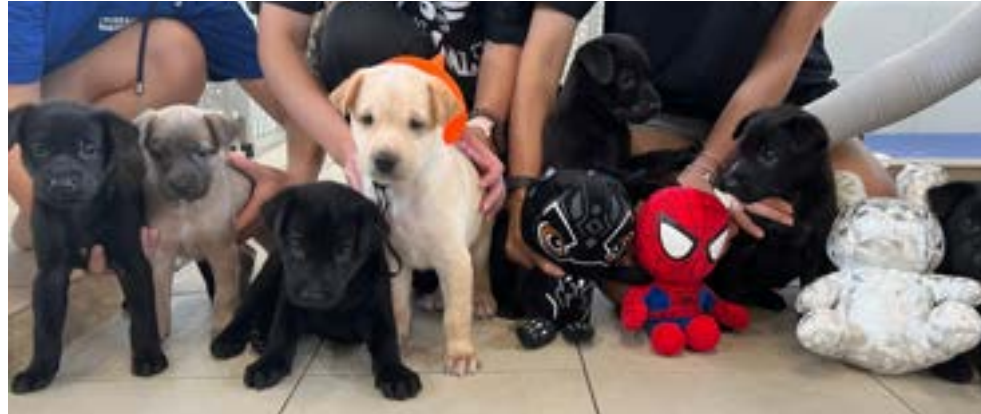
Rainbow Mummy & her puppies