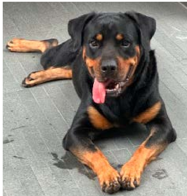
“TIS THE SEASON’: after months of rehoming messages and calls to action, Rocco found his forever family.

Owners of scheduled dogs in Singapore must: Carry insurance for at least S$100,000, provide a banker's guarantee of up to S$5,000, microchip their dogs, and undergo compulsory obedience training.