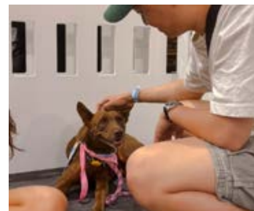
'HAVE YOURSELF A...': merry and cozy home (above). Below, their first meeting at Pet Expo.